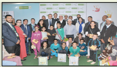
Paying due attention to farmers' children education