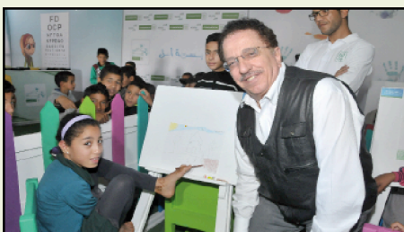
Taking care of special needs