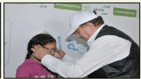
AFA Secretary General putting eye glasses for one of the farmers children.