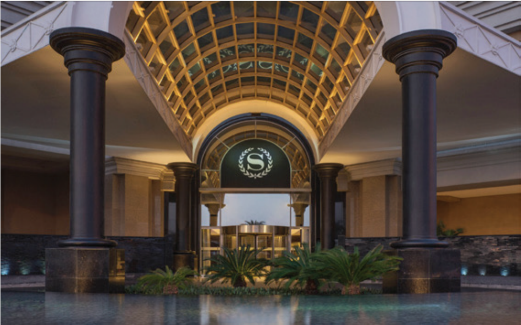
- Workshop Location - Sheraton Mall of the Emirates Hotel Dubai, UAE

The hotel is a short distance from downtown Dubai, Media City and the Dubai World Trade Centre and just minutes from celebrated sites, including Jumeirah Beach, Wild Wadi Waterpark and Ski Dubai.